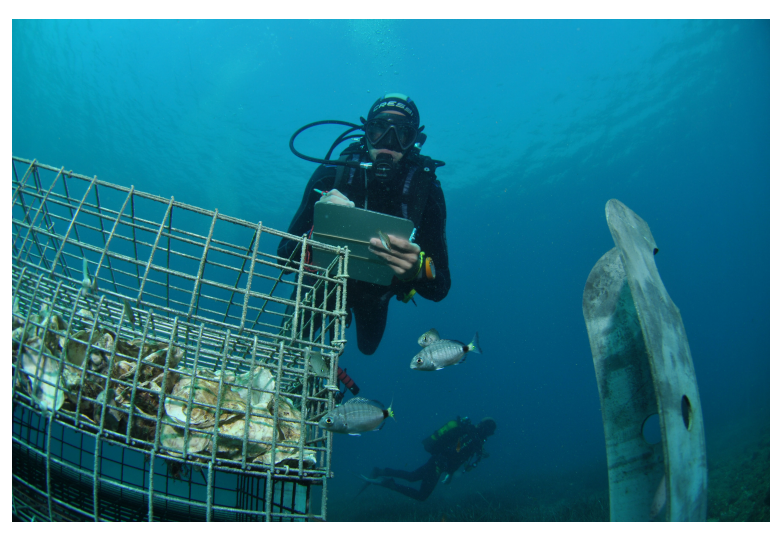
FIGURE 3 Monitoring survival of tagged and released Diplodus sargus with underwater visual surveys.

with stakeholders should develop early accountable decision-making, aid in prioritising and selecting species for enhancement, and evaluate socio-economic and ecological costs and benefits (Table 1; Lorenzen et al., 2010).