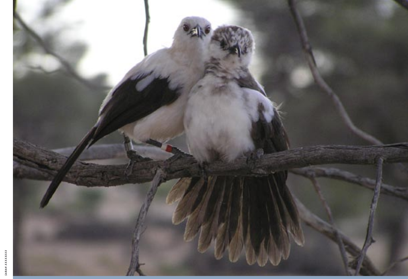
The brood is still entirely dependent on the adults for food when Tomboy and Patch begin to build a second nest

y the time the third clutch hatches, Bambi, Thumper, Matty and Little Myxie are old enough to help feed the nestlings, although their provisioning rate is much lower than that of the adults simply because they are less efficient at finding food. At this age, the juveniles (with the exception of Little Myxie) begin to engage in a number of aggressive interactions that suggest they are fighting for dominance amongst themselves. Matty begins following Thumper every time he feeds at the nest. Eventually, when Thumper approaches the nest, Matty chases him away. An extended, violent conflict follows, with the two birds rolling about on the sand. Finally, Matty steals Thumper's food item and feeds it to the chicks himself. This behaviour appears unusual, although previous researchers have suggested that when fledglings