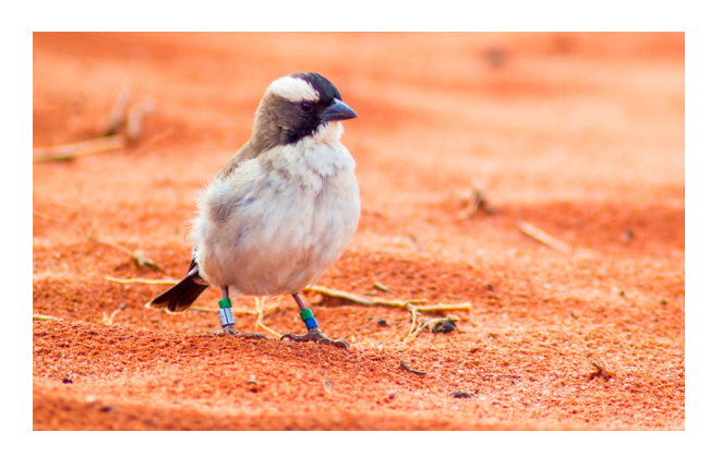
Figure 1. A male white-browed sparrow weaver, Plocepasser mahali , in Tswalu Kalahari Reserve, South Africa.

not successfully caught after song recording on day 1 (both of which had been assigned to the PHA treatment) and so these males have been excluded from all analyses. Four males were not successfully recorded at dawn on day 2 (one PHA, three PBS), and so could not be included in the analysis of the song response to immune challenge. Seven males (three PHA treated, four PBS treated) evaded capture on evening 2, and so could not be included in the analysis of the body mass response to immune challenge. Final sample sizes are provided for each analysis in the Results.